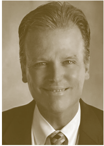
Mayor Jeff Nelson