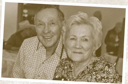
At The Country Hoe-Down!