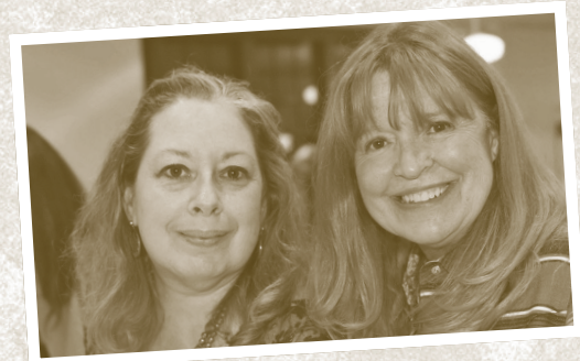
What FUN We All Had